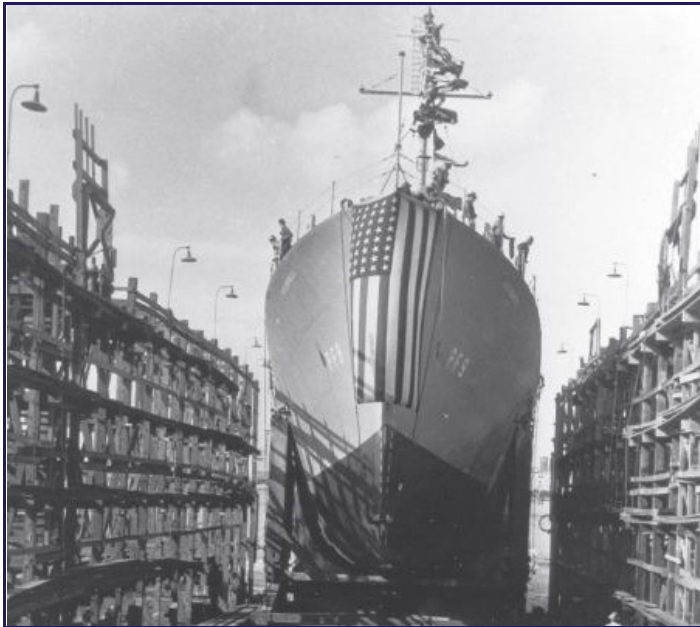
USS Pocatello Launch, October 17, 1943

The City of Richmond is located 16 miles northeast of San Francisco on the western shore of Contra Costa County. Richmond was incorporated on August 7, 1905 and became a charter city on March 24, 1909.